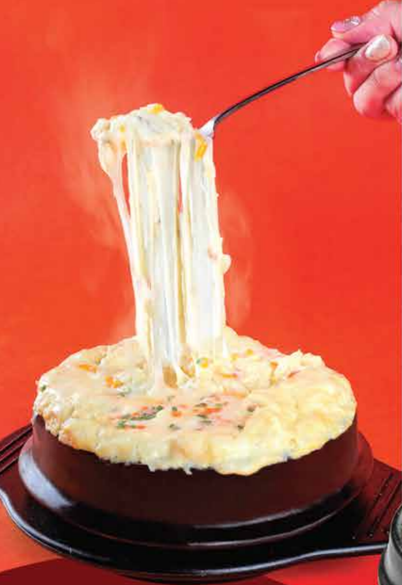
301 치즈계란찜 CHEESY GYERAN JJIM 10.90 Korean steamed eggs with cheese.